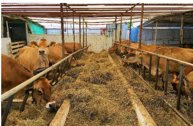
Brothers Bullari farm