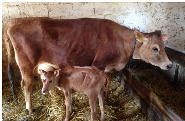
Donated heifer with calf

Price approx. 650 eur. per pers. in double room (single room approx. 120 eur. more)